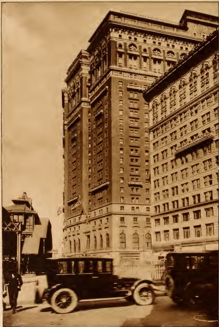
McALPIN HOTEL, on Broadway between 33d and 34th Streets, cost $13,000,000. Has 28 stories, 1620 all outside rooms, 1100 baths and 1800 telephones.